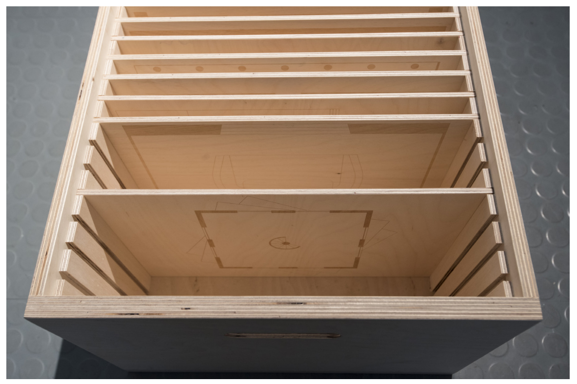
Anne Tallentire, From, in and with , (2103), detail: box with 24 birch ply etched panels. Gallery of Photography, Dublin.