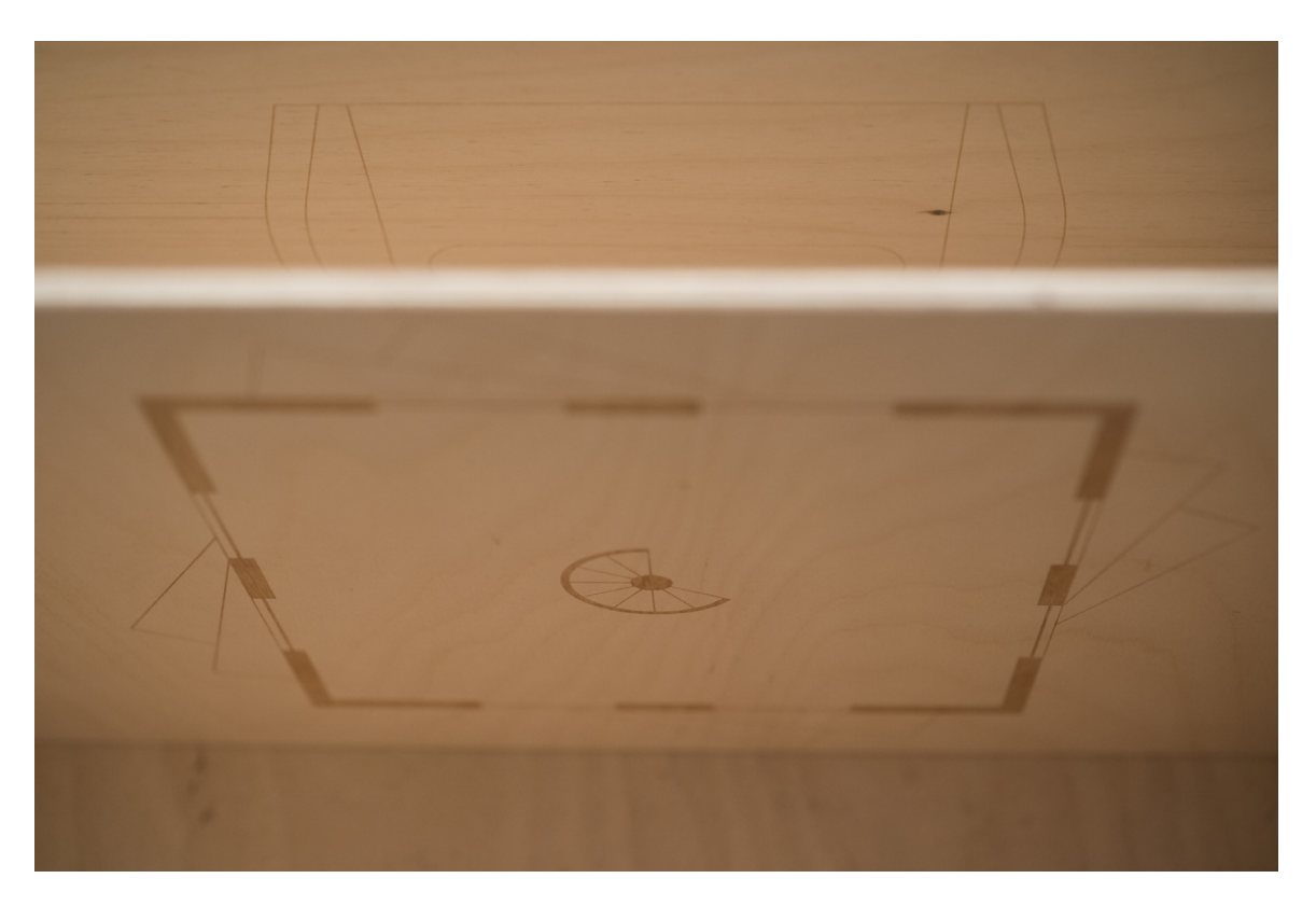
Anne Tallentire, From, in and with , (2103), detail: box with 24 birch ply etched panels. Gallery of Photography, Dublin.